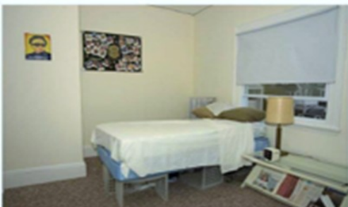
LEVEL 1 1

Please select the photo that most accurately reflects the amount of clutter in your room.