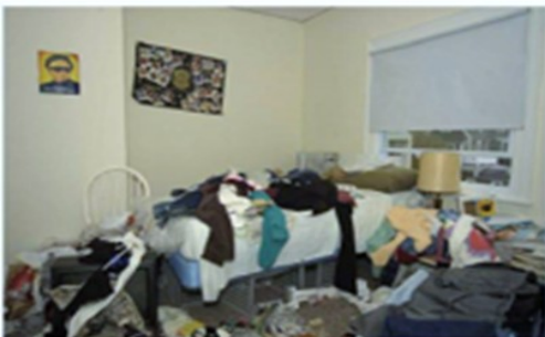
LEVEL 2 4