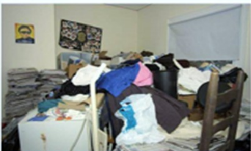
LEVEL 3 7