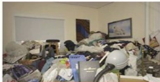
LEVEL 3 7