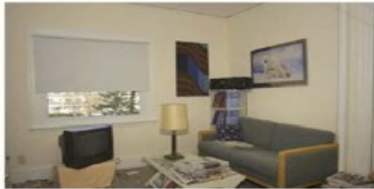
LEVEL 1 1

Please select the photo below that most accurately reflects the amount of clutter in your room.