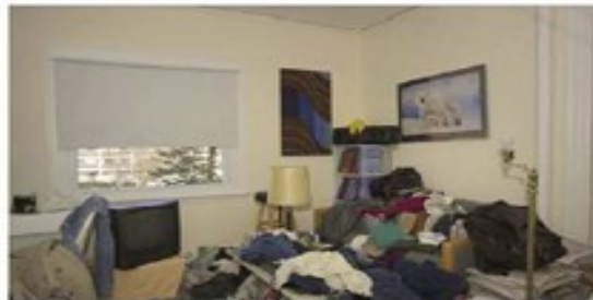
LEVEL 2 4